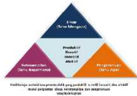
Gambar 1. Proses dan Hasil Pembelajaran Pendekatan Scientific

The learning process in a scientific approach to touch three areas , namely : attitude , knowledge , and skills , as in Fig.1 below: