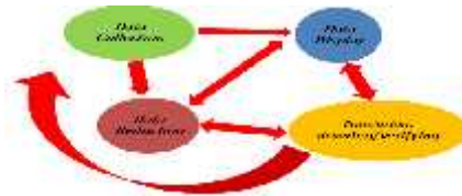
Gambar 4. Komponen dalam analisis data (interaktif model)

already saturated . Activities in the analysis of the data , that is data reduction, data display, and conclusion drawing / verification . Analysis steps shown in the following Picture 4.