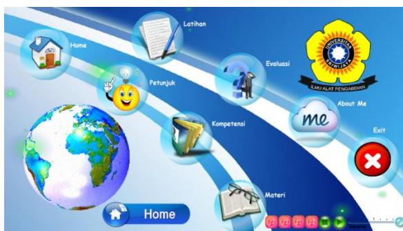
Figure 2. Main Menu Page Views Interactive Multimedia

media text, visual silent, visual motion and audio as well as computer-based interactive media and information and communication technology. Researchers use Sothink SWF Quicker application to create interactive multimedia on the material sound waves because Sothink SWF Quicker have a lot of animation effects on text created. At this stage of development, created the first and following prototype is the Main Menu Page Views Interactive Multimedia.