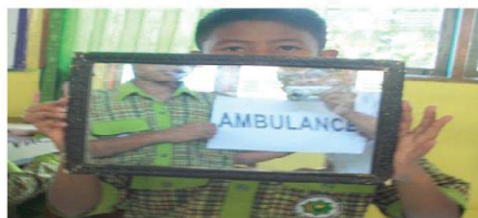
Figure 1. Student Observing "AMBULANCE"

In this activity students are asked to observe the "AMBULANCE" paper made upside down in a mirror and students are asked to answer questions available on LAS 1 in groups. The question question asks if the writing is as big as the reflection in the mirror. In the first question the whole group responded correctly and almost the same.