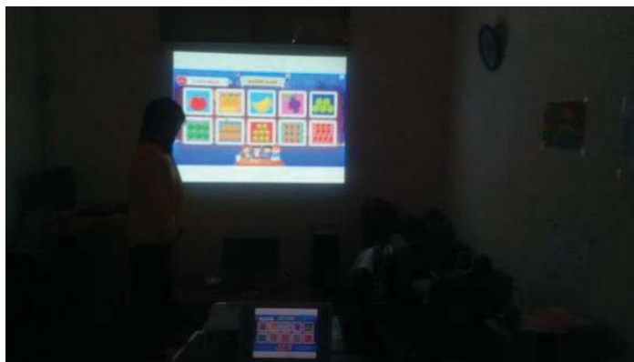
Picture 1. Teacher teaching a number concept for students