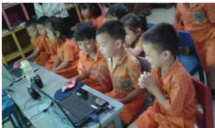
Picture 2. Some students waiting to use laptop