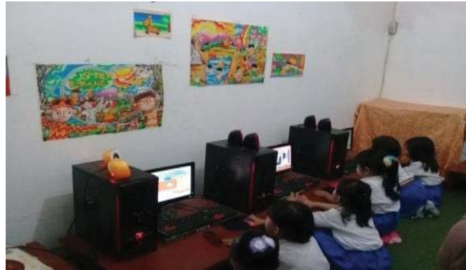
Picture 3. Teachers use some laptops for students

The results from data collected during the pre-action activities, cycle I, and cycle II can be concluded that the ability to recognize the number concepts of children aged 5-6 years in Public Kindergarten Pembina 1 Palembang increases after using interactive video media as evidenced by an increase in percentage in each aspect, namely ability to sort numbers 1-20 and calculate the number of numbers reaching 25% in the pre cycle, then 45% in the first cycle, and the last 80% in the second cycle.