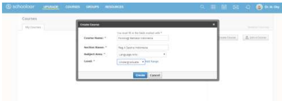
Figure 1. Creating a Course in the Schoology Application

Based on the Figure 1 above, the course created is Indonesian Phonology. At this stage, the lecturer only enters some important information about the identity of the course, such as the name of the subject, the subject/student who follows the learning in the course and the education level.