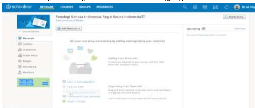
Figure 2. Using Access Code in the Schoology Application

Based on the Figure 2 above, the giving of the student code to the students who will take part in online learning in Schoology applications needs to be limited so that the lecturers can ensure that members who are registered in the online class are the students in face-to-face classes. Furthermore, the students and the lecturers will be asked to log in using the RCQKT-X3877 access code previously given by the lecturer. Thus, the students wait for the confirmation from the lecturer to enter into online learning in the Schoology application.