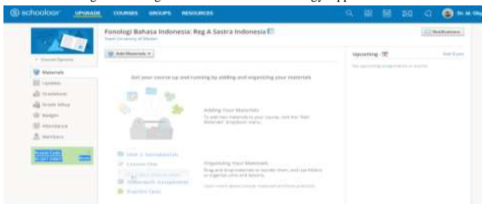
Figure 2. Using Access Code in the Schoology Application

Based on the Figure 2 above, the giving of the student code to the students who will take part in online learning in Schoology applications needs to be limited so that the lecturers can ensure that members who are registered in the online class are the students in face-to-face classes. Furthermore, the students and the lecturers will be asked to log in using the RCQKT-X3877 access code previously given by the lecturer. Thus, the students wait for the confirmation from the lecturer to enter into online learning in the Schoology application.