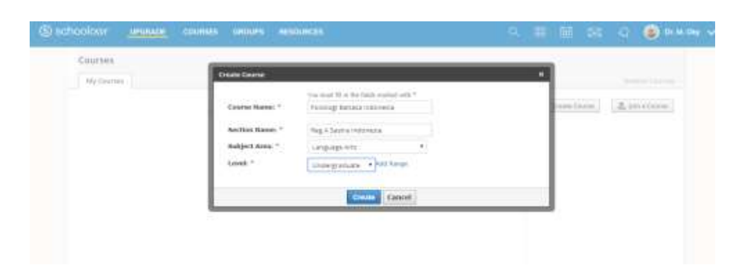
Figure 1. Creating a Course in the Schoology Application

Based on the Figure 1 above, the course created is Indonesian Phonology. At this stage, the lecturer only enters some important information about the identity of the course, such as the name of the subject, the subject/student who follows the learning in the course and the education level.